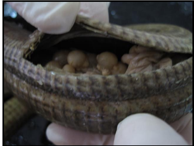
Figure 3. Eggs with miscellaneous dimensions in a dissected P. apodus .

(from Ordu) gave birth to five juveniles and four stillborns in sacks. The SVL of the juveniles was determined as 52 mm, 55 mm, 53 mm, 56 mm and 49 mm respectively. The SVL of the stillborns was measured as 49 mm, 48 mm, 45 mm and 42 mm respectively (Figure 2).