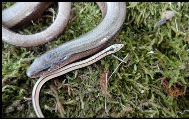
Figure 1. Anguis fragilis complex individual with a newborn.