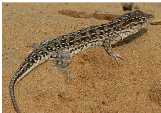
Figure no.2 Adult E. a. deserti from "Hanu Conachi"

22°C. There is a very low level of precipitation, with average annual values of 400 mm. The reserve is situated at altitudes of between 14 m a.s.l. in the southern areas of the Reserve to 20.5 m a.s.l. in its central area.