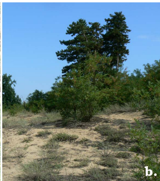
Figure no.3 A - Aspect of the "Hanu Conachi River Sand Dunes" Nature Reserve with R. pseudoacacia plantations B - The steppe runner habitat inside the reserve