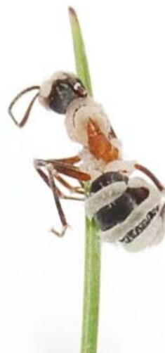
Figure 3. Pandora -infected Formica exsecta worker after the outbreak of the fungi.

Europe. It is known from the territory of the former Czechoslovakia (Balazy 1993), Germany (Balazy 1993), the Netherlands (Boer 2008), Poland (Balazy 1993, Sosnowska et al. 2004), Russia (Marikovsky 1962), Sweden (Balazy 1993), Switzerland (Turian & Wuest 1977, Balazy 1993), and the territory of the former Yugoslavia (Balazy 1993).