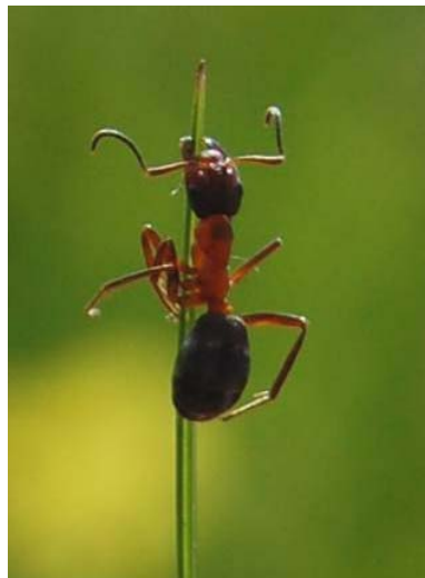
Figure 2. Pandora -infected Formica exsecta worker before the outbreak of the fungi.