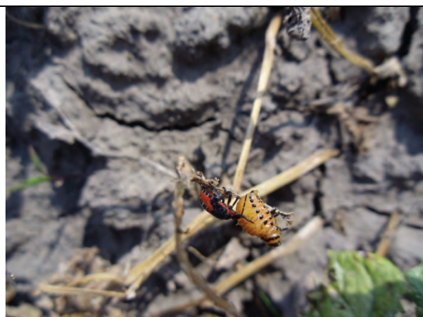
Figure 2. A stink bug larva of III age attacking a Colorado potato beetle larva (original).