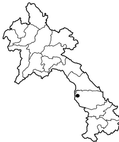
Figure 1. Megapomponia bourgoini sp. nov., distribution map.

Head : slightly narrower than mesonotum; castaneous with the following marks: a median piceous mark enclosing ocelli except lateral border of lateral ocelli, extending along posterior half of anterior arm of epicranial suture and anteriorly along midline, terminating posterior to frontoclypeal suture; fuscous area on anterior third of supra-antennal plate; fuscous mark on vertex about half the distance between eye and frontoclypeal suture, following curvature of eye to level of lateral ocellus where mark narrows, connecting to piceous mark that extends from posterior to eye. Head covered dorsally with fine golden pile, longer and thicker posterior to eye. Antennae piceous except castaneous scape, proximal pedicel, and ventral portion of first and second flagellar segments. Genae with large piceous spot. Lorum with piceous spot on posterior two-thirds. Postclypeus with piceous mark dorsally along midline splitting along medial borders of transverse ridges then fusing along midline centrally forming a castaneous spot on apical midline. Mark extending laterally into transverse grooves increasing in length reaching the border at the supra-antennal plate and the next three grooves, then decreasing in length in the next three