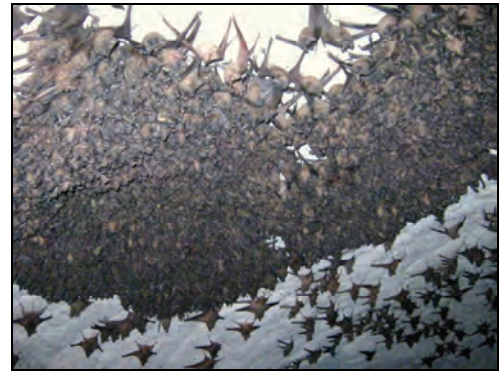
Photo 2b. A winter hibernaculum of mixed population of bats (Partap Singh).