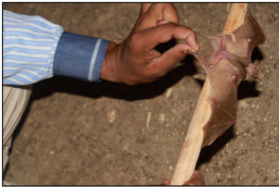
Photo 2a. Priest of bat temple performing witchcraft (Partap Singh).