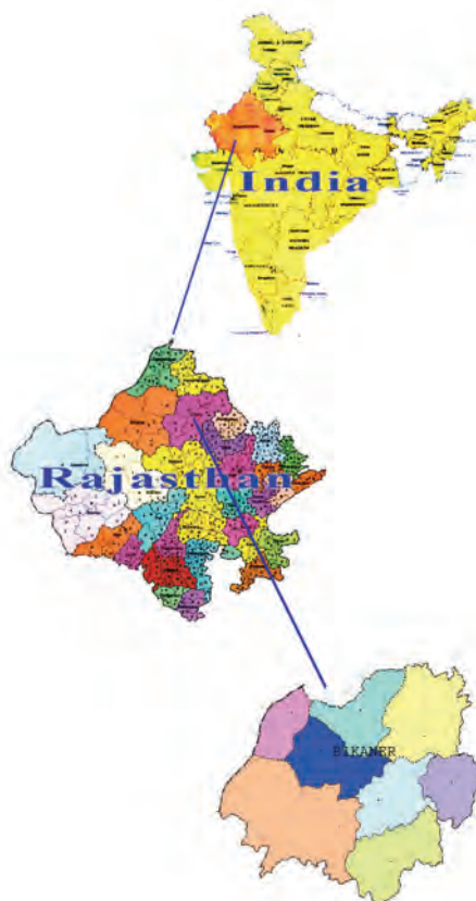
Figure 1. Location map of study area (by Vivek Mittal).

Study Area. Bikaner (28°11'22 N and 73°19'13 E) occupies the north western part of Rajasthan State in India (Fig. 1). During summer, temperature ranges from 27°C to 45°C and it may rise to as high as 49-50°C, and contrary to this it dips to freezing point and sometimes drop down to as low as -2°C. After the arrival of Indira Gandhi Canal (I.G.C.), the climate of this area has changed and the insect population has increased manifold and many of these newly emerged insect species are pests. Rainfall amount is very poor in Bikaner. The average rainfall here is 270 mm. This condition makes day temperature very high and nearly 90% of the rainfall is received during the monsoon season, which usually lasts from July to September. New species of bats extend their distribution range in the zone due to the ecological changes brought by I.G.C. in the region. The climate has become humid and because of this plenty of insect-food for insectivorous bats is now available and due to this reason the population of insectivorous bats is increasing and not only the population, but the diversity is also increasing at a very rapid pace. The frugivorous bats find plenty of fruit trees as a food source, which are planted in this area.