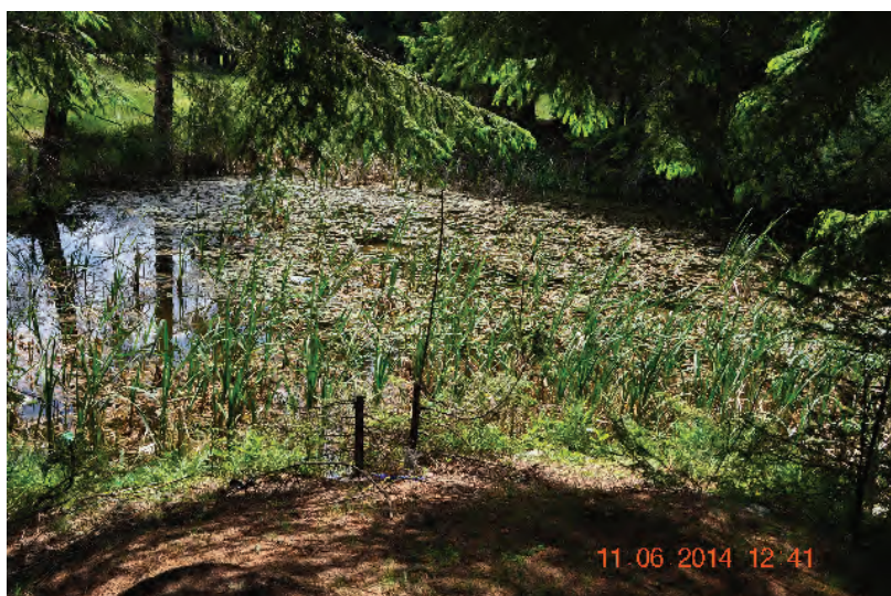
Figure 2. P. parva 's habitat in Vâlsan Glades.