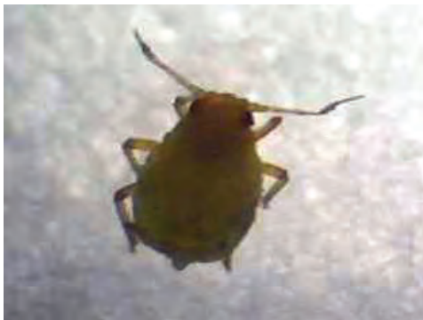
Figure 1. Aphis pomi aptera (original)