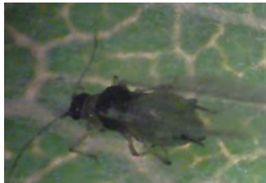
Figure 2. Aphis pomi alata.(original).